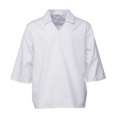
8124 SHIRT WHITE ¾ SLEEVE 65% PES/ 35% CO, 195g