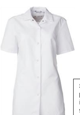
Side pockets inside seam