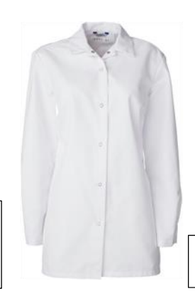
Side pockets inside seam