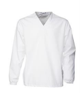
17809 BAKER SHIRT U WHITE 65% PES/ 35% CO, 150g