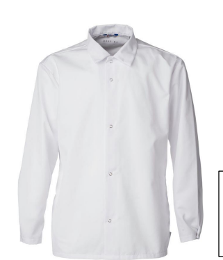
Side pockets inside seam