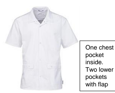
3414 ALEC COAT SHORT SS M