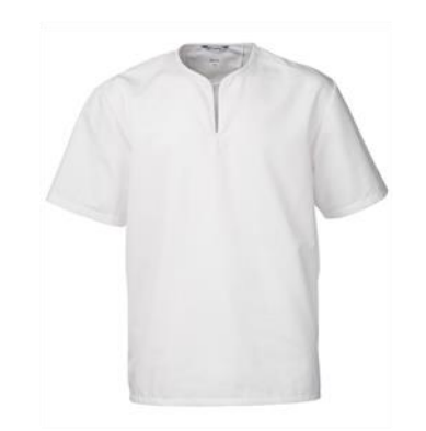
3859 BAKER SHIRT SS M 100% CO