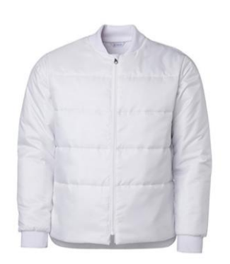
1V7136 REMI WADDED JACKET LS M 100% PES, 74g