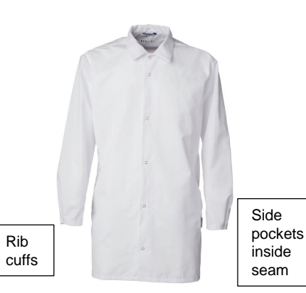
8001 ALEC COAT LONG LS M