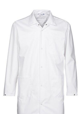
1L3802 ALEC COAT SHORT LS M