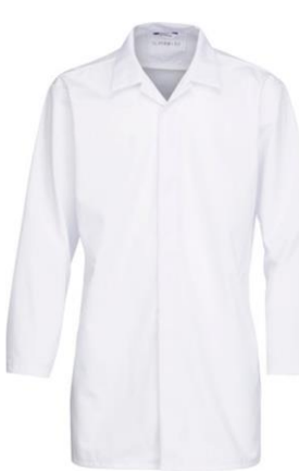
1L1013 ALEC COAT LS M