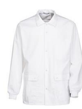
Rib cuffs. Front patch pockets with flap. One chest pocket inside