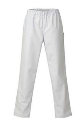
1L3277 HILKKA TROUSERS W

Unisex fit. Elastic waist. One big internal pocket.