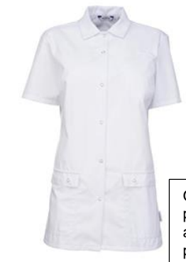
One chest pocket inside and two patch pockets with flap