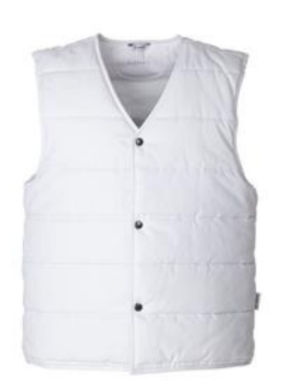
1L2226 MARLON WAISTCOAT U