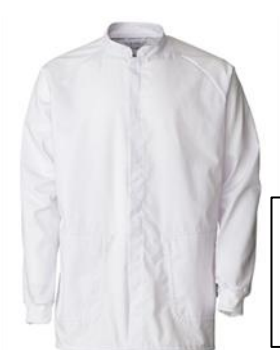
Internal pockets with flap in waist. Concealed closure. Raglan sleeves.