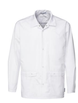
One chest pocket inside and two patch pockets with flap