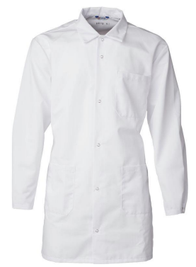
8019 ALEC COAT LONG LS M