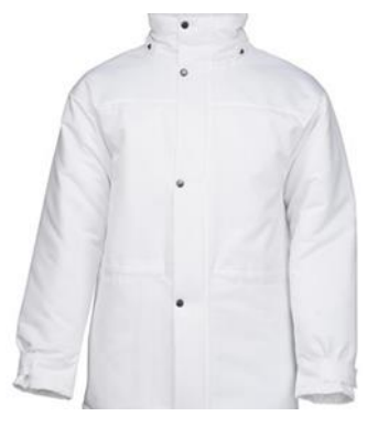
18761 ROSS WINTER COAT M 70% PES/ 30% CO, 235g