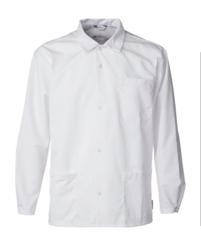
One patch pocket at left chest. Two lower patch pockets

One chest pocket inside.Side pockets inside seam.