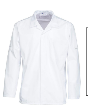
1L7951 ALEC COAT SHORT LS M 65% PES/ 35% CO, 245g