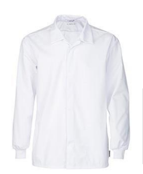
Rib cuffs. One lower inside pocket