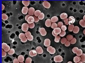
Photo of Enterococcus Faecium